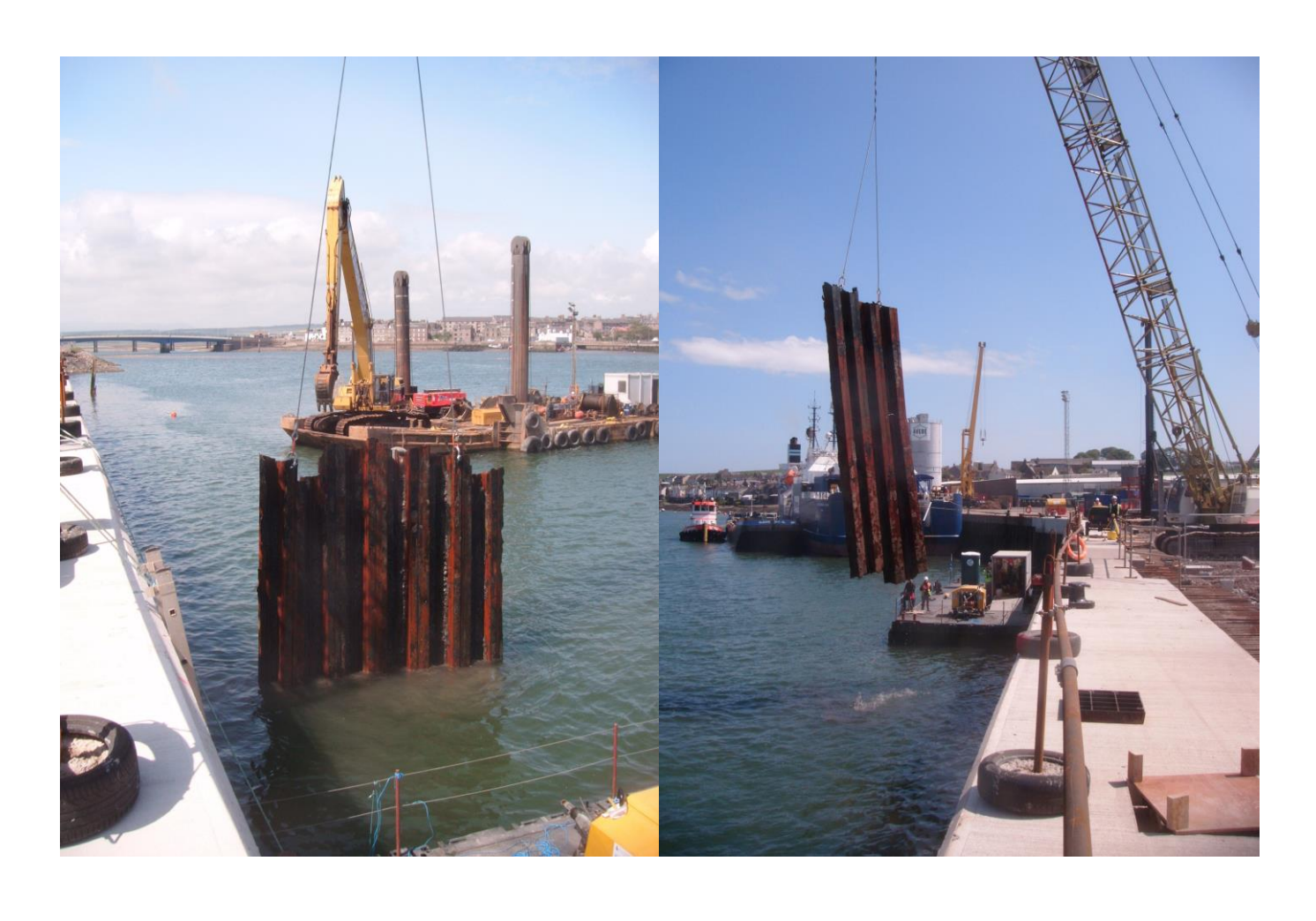
Panel of collapsed sheet piles burned off underwater & being lifted off seabed and set onshore